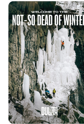
Static Pin | #2