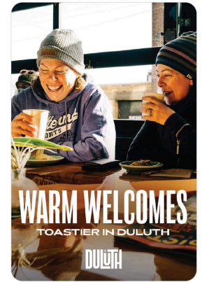
Static Pin | #3